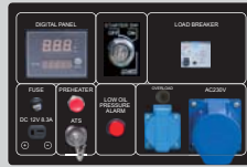
Single Phase LED5