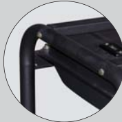
32mm frame and big fuel tank