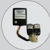
Remote control module plug inside the control panel, metal hand controller ensures max. to 100M distance controlling