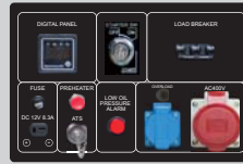
Three Phase LED3