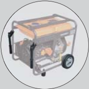
Push wheel kit 8 inch / 10 inch optional