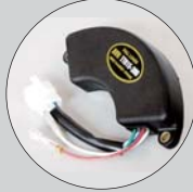
New AVR Regulation for full loads application