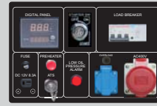
Three Phase LED5