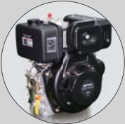
Diesel Engine Single cylinder, vertical, 4-stroke, air-cooled